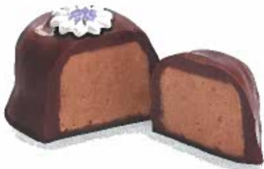
Peanut Butter Egg An irresistible treat. 3 oz $7.00 #9499