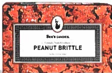
Peanut Brittle Buttery, crunchy and irresistible. 1 lb 8 oz $22.25 #355