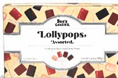
Assorted Lollypops Vanilla, Butterscotch, Café Latté and Chocolate. Approximately 30 lollypops. 1 lb 5 oz $21.00 #296