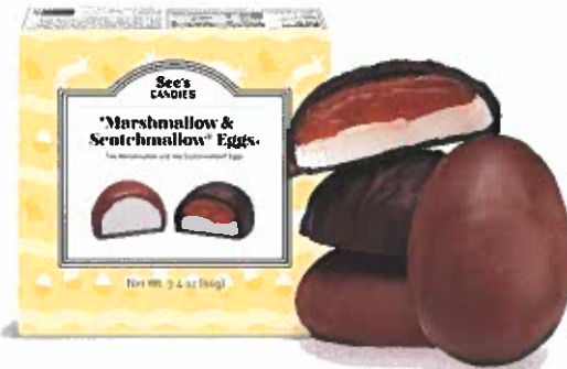
Marshmallow & Scotchmallow® Eggs One box, four yummy eggs. 3.4 oz $7.00 #9493