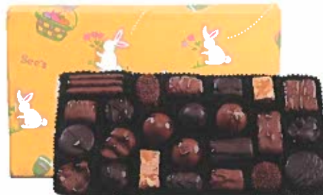
Assorted Chocolates Milk and dark decadence. Delivered in seasonal wrap. 1 lb $22.50 #40318