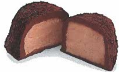
Bordeaux™ Egg A tasty classic. 3 oz $7.00 #9501