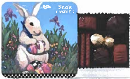
Bunny Artist Box Full of See's favorites. 4 oz $8.00 #9726