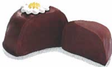
Chocolate Butter Egg Creamy and delicious. 3 oz $7.00 #9500