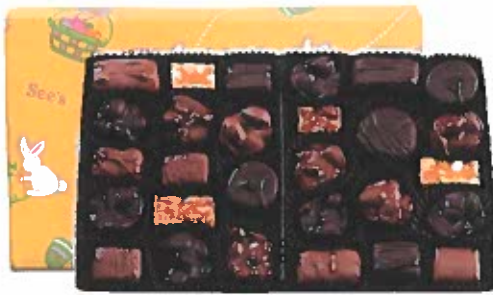
Nuts & Chews Yummy, crunchy and chewy. Delivered in seasonal wrap. 1 lb $22.50 #40334